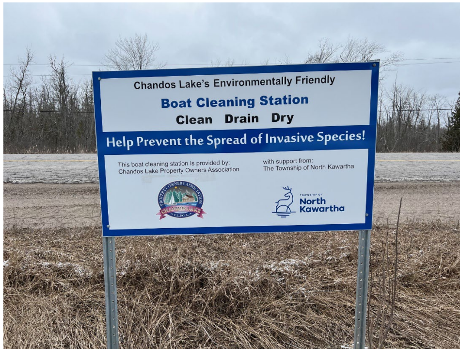
Current sign facing the Lake