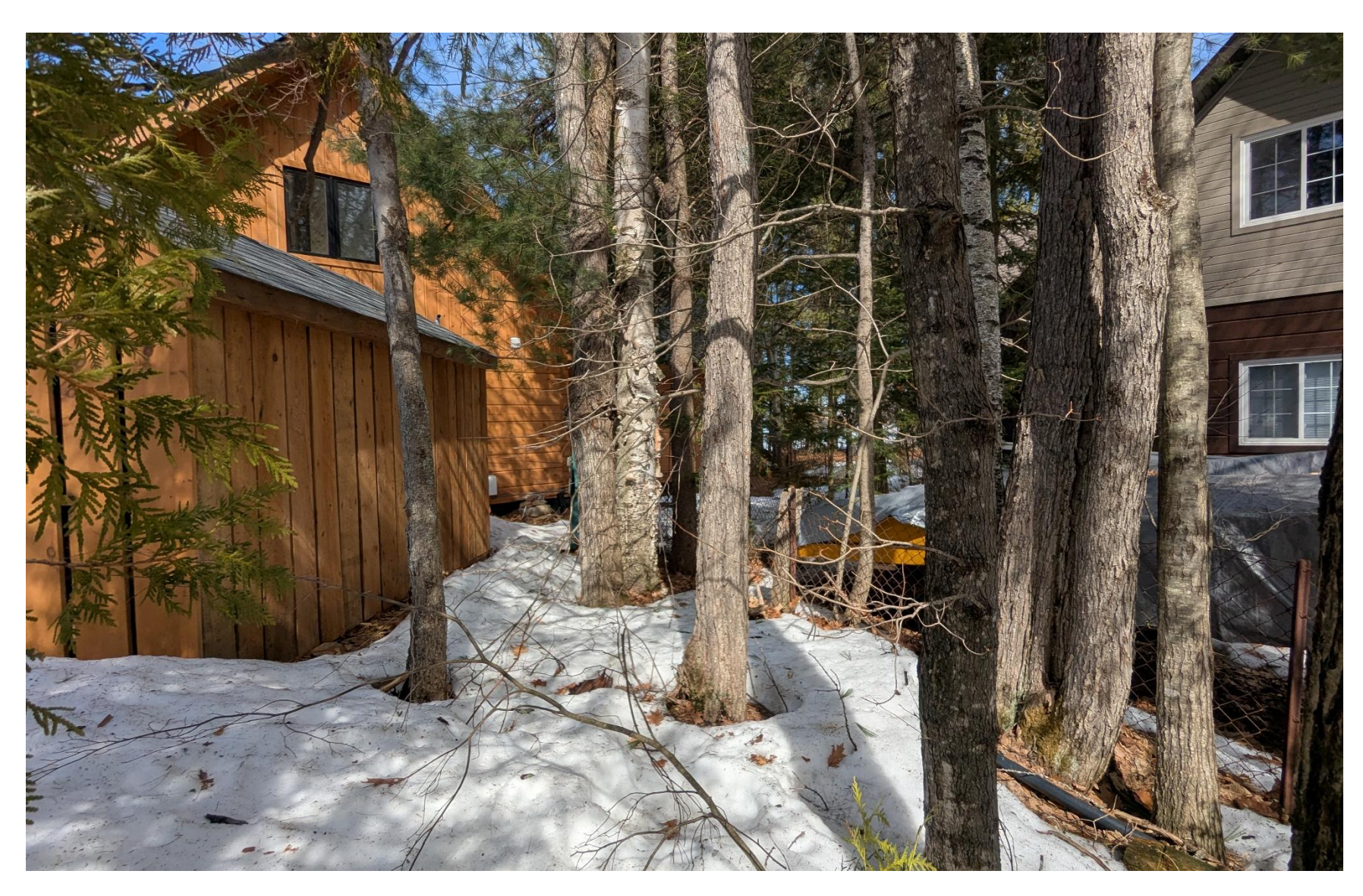
Figure 3 Vegetation in eastern side yard adjacent woodshed facing northeast.