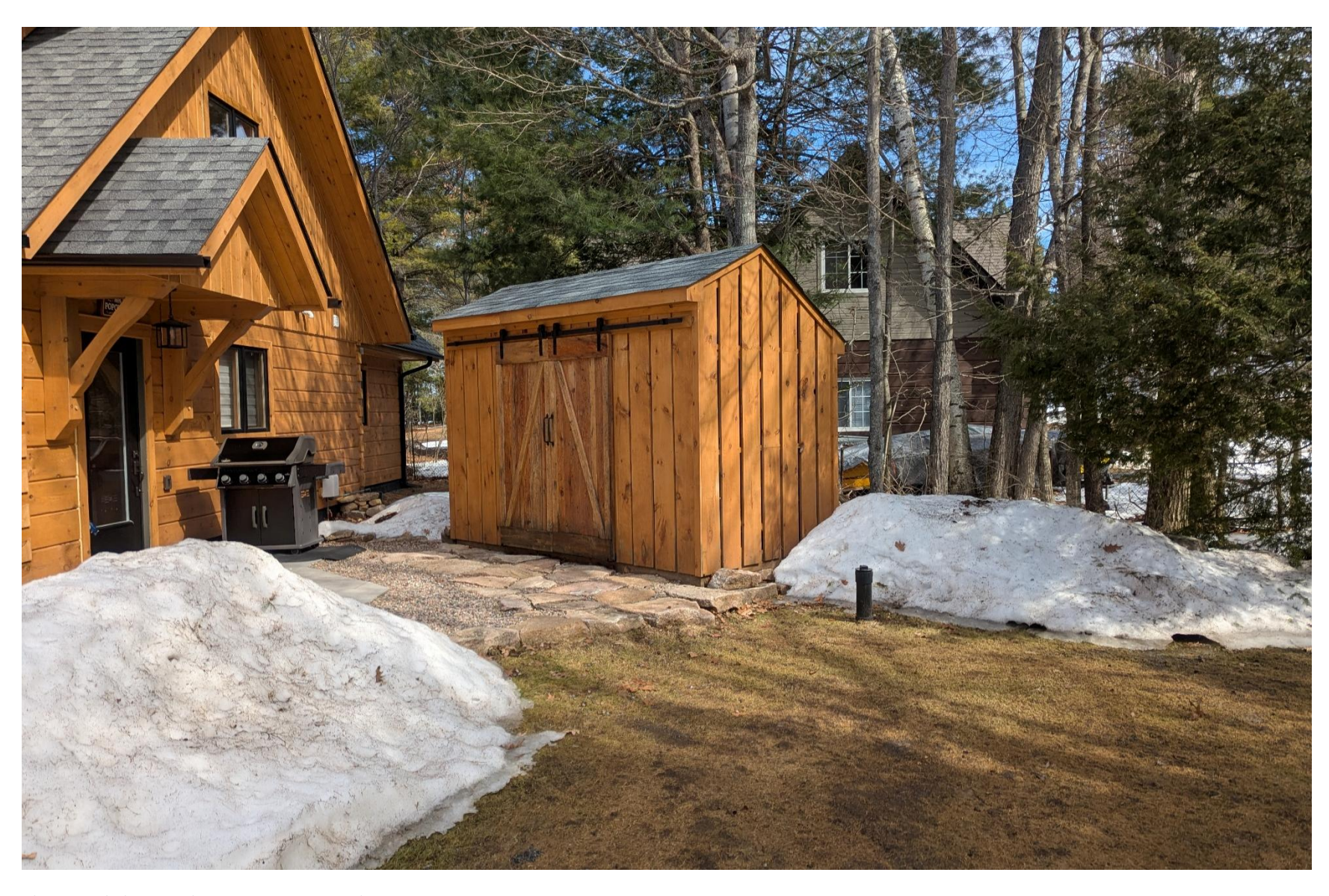
Figure 2 Existing dwelling and woodshed facing east.