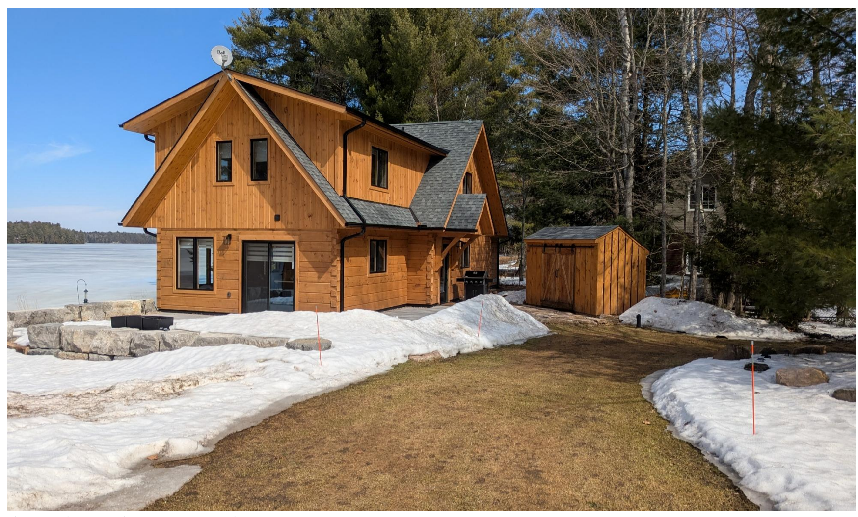
Figure 1 Existing dwelling and woodshed facing east.

Application A-04-25 (Popovich) Part of Lot 15, Concession 5, Chandos Ward 30 Wally's Way Roll # 1536-010-200-28210