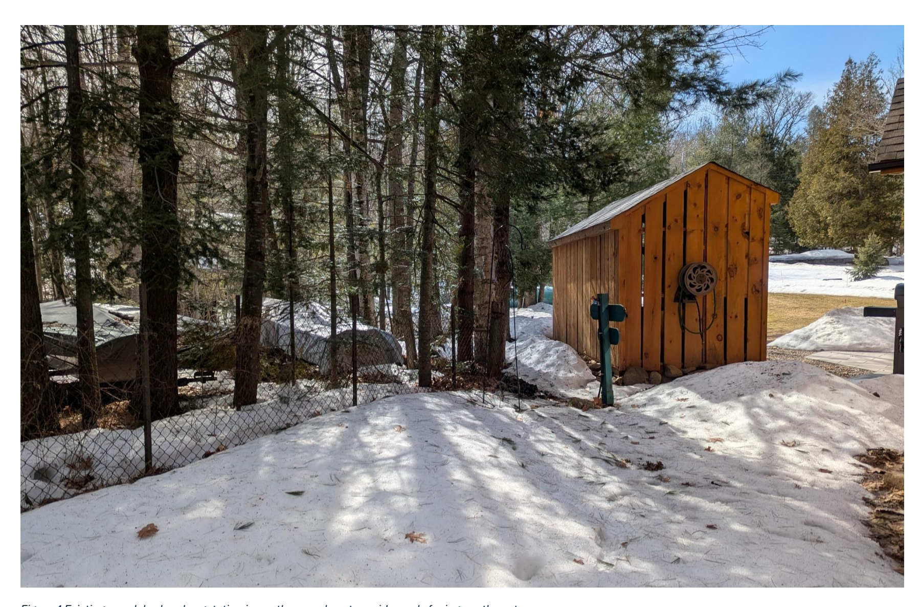
Figure 4 Existing woodshed and vegetation in southern and eastern side yards facing southwest.