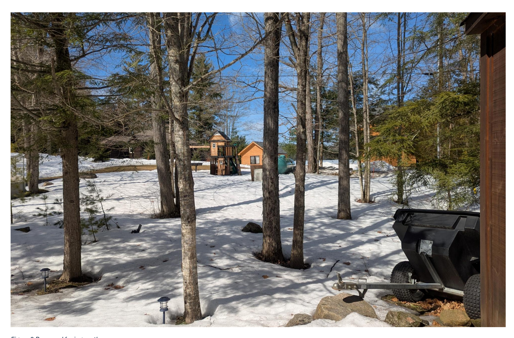
Figure 8 Rear yard facing north.