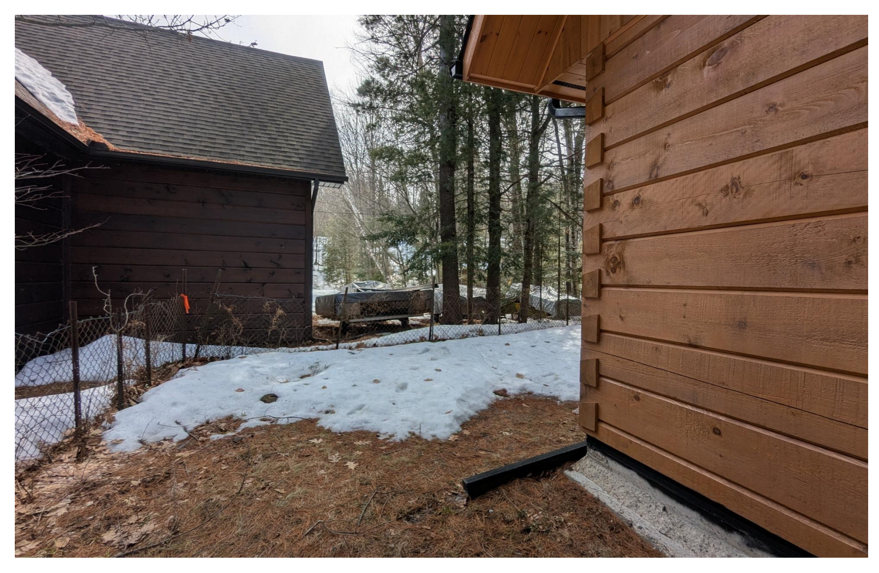
Figure 6 Vegetation in southern side yard to rear of dwelling and detached garage on east-adjacent property facing south.