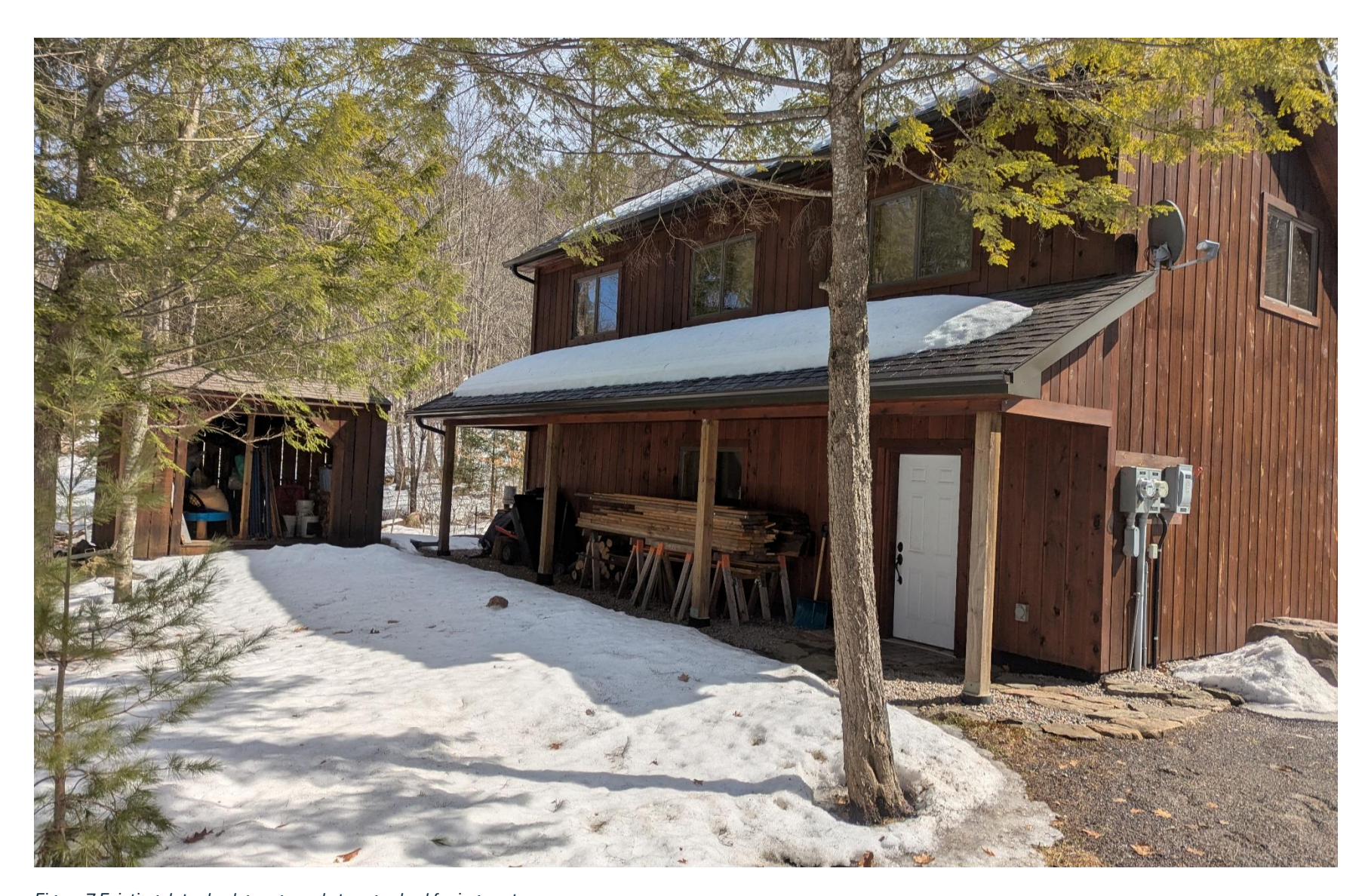
Figure 7 Existing detached garage and storage shed facing east.